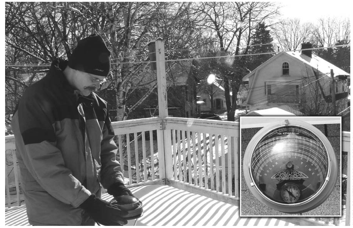
A site assessor uses a solar pathfinder to determine the effectiveness of solar energy at this home before the homeowner invests in a solar electric or solar hot water system. The inset photo to the right shows the Solar Pathfinder under ideal conditions.

To learn more about Focus on Energy, call 800.762.7077 or visit focusonenergy.com